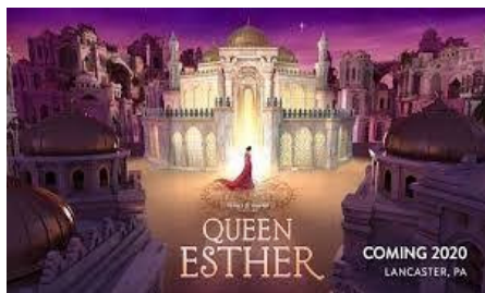
Trip ID # 46733