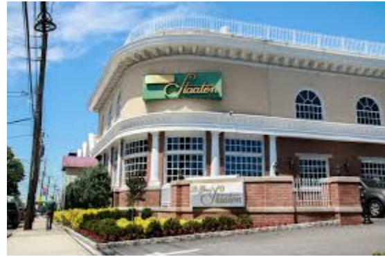
Trip ID # 46729