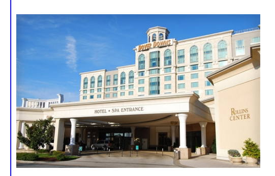
Trip ID #46074