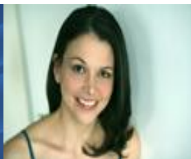
Tony Award Winner Sutton Foster

Wednesday, April 27, 2011 $162 pp Orchestra/Front Mezz $132 pp Rear Mezz