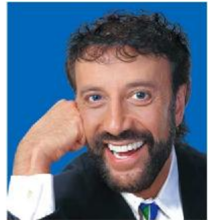
Yakov Smirnoff "What a Country"